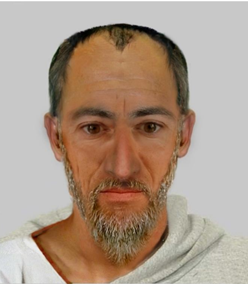
Bildmontage LKA NRW, 02/08